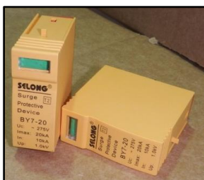
Replacement cartridge Kit Contains 2 cartridges